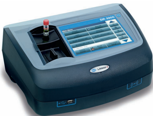
DR 3900 Spectrophotometer