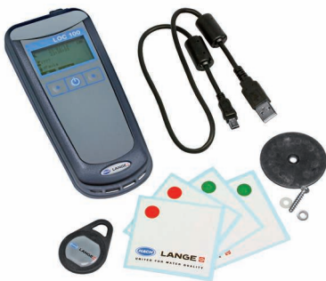
RFID locator LOC100 with coloured RFID tags for samples, robust RFID tags for the sampling location, and RFID tags for users

The LINK2SC connection between the photometer and the SC Controller allows process results and laboratory reference values to be compared directly on the photometer. Data can be exchanged via the Ethernet in both directions, meaning matrix corrections for process probes can be performed directly by the laboratory.