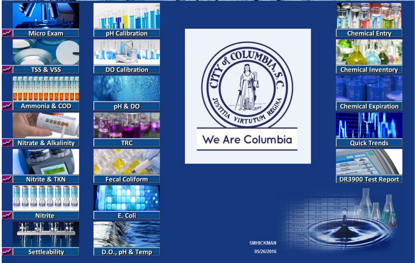
Columbia WIMS Lab Dashboard